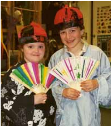
Students wearing their silk kimonos, using their hand painted fan

In the Hall of Protected Harmony's Throne room, our guide sat on the throne and pretended to be the young Emperor. We remembered to remove our shoes and bow as we entered the dining hall. Most of us were successful using our chopsticks to eat Chow Mien and rice from rice bowls. He served us nuts, dried fruits and oranges from the tray of Togetherness. We concluded our celebration of the New Year of the Monkey by opening our red envelopes decorated with gold writing (and found money inside our envelopes)! We tried our hand at writing Chinese characters, painting our own designs on fans and making pandas. We hated to leave but the wonders of Australia awaited us!