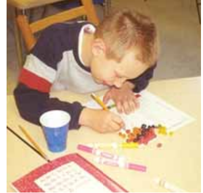
Making a jelly bean graph

We have almost reached our goal of 10,000 pennies. If each elementary UE and LE were to bring in 60 pennies, we would meet our goal. The money collected ($100) will go to UNICEF. We are close to becoming ambassadors this year (raising $1,000). This is a great accomplishment for such a small school.