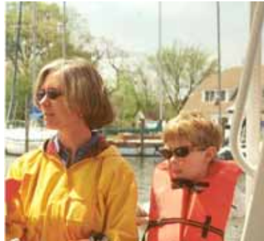
The fishing boat ride