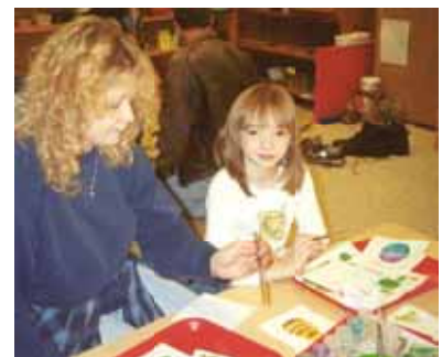
Painting geometric shapes

The 2 nd year students have started taking the Stanford Achievement Test. We will continue testing for approximately 45 minutes a day for the next two weeks. First year students will begin individual Albanesi Montessori testing soon.