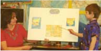
Our guide taking us to the Forbidden City

When we arrived in busy Beijing China, our guide was waiting for us just outside the Palace of the Forbidden City. He showed us a chess set carved from jade, pearls, hand embroidered silk clothing, beautifully hand painted umbrellas and fans. His carved jade turtle felt smooth but cold.