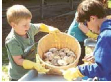
Elementary students sorting oysters

Our field trip to the Captain Avery House and fishing boat was great fun. We learned about oyster fishing and life in the early 1800's. Thank you to all the parent drivers and volunteers that helped out.