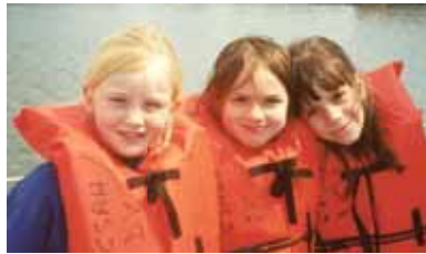
Students on boat trip

Our field trip to the Captain Avery House and fishing boat was great fun. We learned about oyster fishing and life in the early 1800's. Thank you to all the parent drivers and volunteers that helped out.