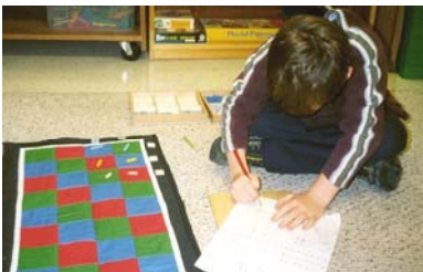
Working with the checkerboard

We had a great time at Bowles Farm. The children went through the corn maze twice. This year the corn maze was in the shape of an F-18 jet. We then went on a hay ride, picked out a pumpkin, and visited the petting barn. According to the children, their favorite activity was playing chase in the "hay pit".