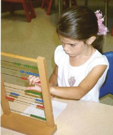
Working with the bead frame

We had a great time at Bowles Farm. The children went through the corn maze twice. This year the corn maze was in the shape of an F-18 jet. We then went on a hay ride, picked out a pumpkin, and visited the petting barn. According to the children, their favorite activity was playing chase in the "hay pit".