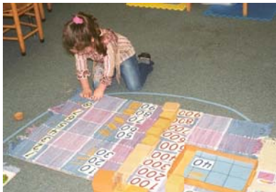
Working with the bank game materials

We're all working hard on our individual plans. We are discovering patterns in our room, on our clothing and in our homes. We are creating the most beautiful patterns for bead necklaces, parquetry block designs and pattern peg designs. Sometimes we follow pattern cards-practicing reading the patterns left to right and top to bottom; and sometimes we get to make up our own distinctive designs. Friends are working hard discriminating sounds and blending sounds into words.