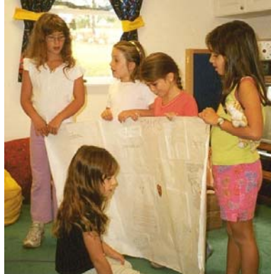
Tidewater friends giving a report on tigers