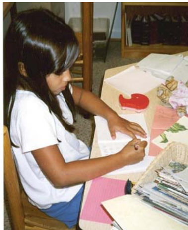
Writing a story