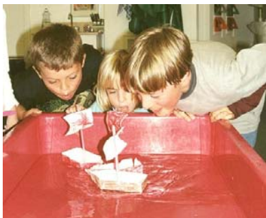
Columbus Day boat races

Would you believe that some of our number/bank work fills up more than one mat? It's amazing how much work gets done in just one day. And we save time to read our favorite stories, hear about Uncle Wiggily's Adventures and sing songs. We've been reciting an October poem before lunch each day. And, now we know it all by heart!