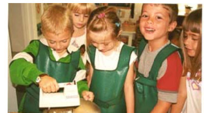
Mixing up our Pumpkin Streusel

We had a wonderful morning at Gramp's Farm-petting the rabbits and goats, checking on the chickens and ducks, tossing the hay, bobbing for apples, and picking the perfect pumpkin! We have enough pumpkins to paint some, carve some and have one left over for cooking. We have so many ideas for the cooked pumpkin-pie, cake, pancakes, muffins and cookies.