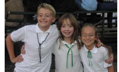
The Calvert County Fair by Philip