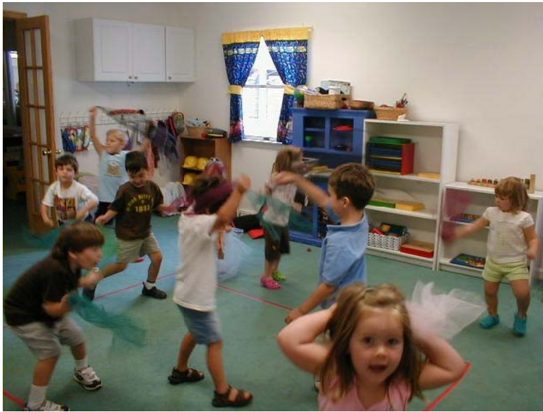
Dancing with the PK stars!