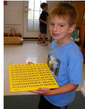
Elem. friend proudly shows his completed hundred board.