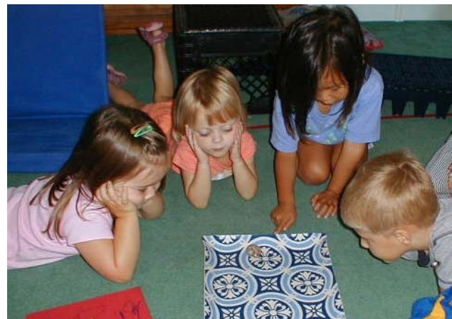
The hermit crab comes out of her shell