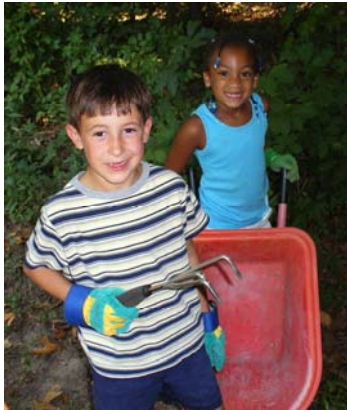
Elementary friends help with the gardening.

With October around the corner, new projects and ideas await us all. Several children have proposed and begun forming interest-oriented clubs (thus far we have the Animal Club