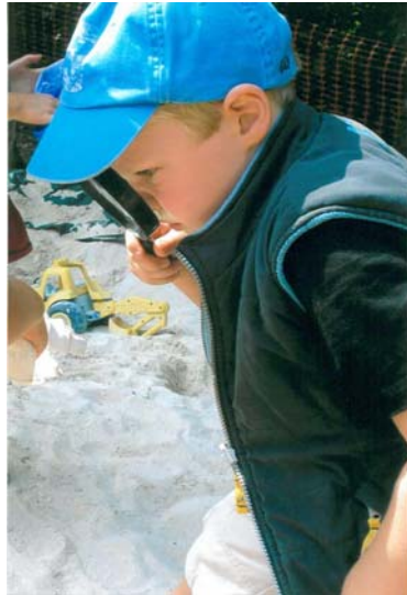
The sandbox is carefully surveyed before beginning to dig.

We've had fun reading about dinosaurs, learning their names and measuring yarn to help us imagine their size. When we stretched the length of yarn for Diplodocus, we had to open our door and walk out into the driveway—80 feet! It was challenging thinking of words to describe something so big. We've really had to use our imaginations.