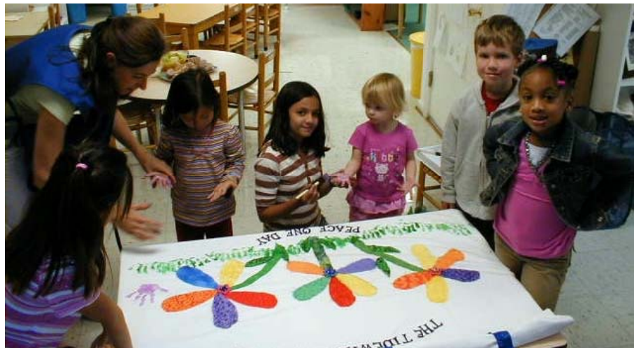
Working on the flag with elementary friends