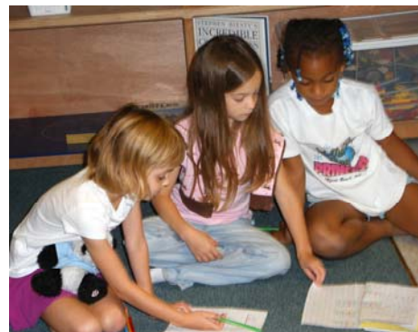
Elementary students review their math work.