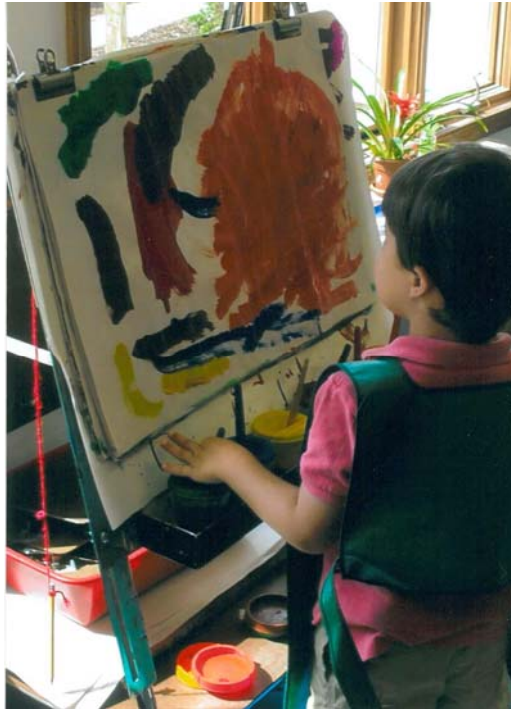
Thinking about pumpkins and fall.

It's hard to believe that we've only been in school for four weeks.