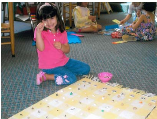
K friend using the grid pattern of her mat to organize her shell counting work.

Our classroom is buzzing with ambitious, productive friends. We've learned who's who, can follow our "maps" to new adventures and are sharing the responsibilities of caring for our room. We even have friends arriving early so they can sign up to help do their favorite job! We're practicing pouring our juice for snack, learning how to serve one helping—even if it's our most favorite food—and making sure we sweep up all the crumbs on the floor. Our classroom is cozy, comfortable and clean.