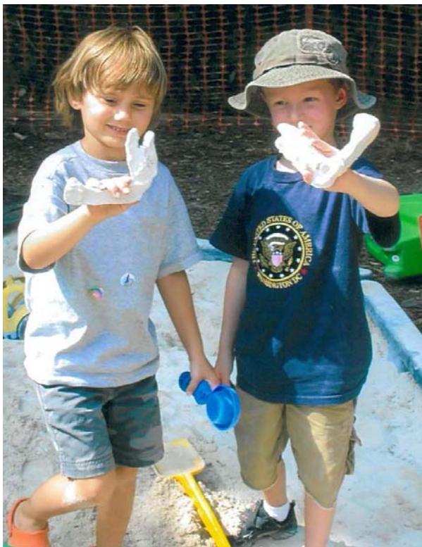
A team of paleontologists dug in the sandbox. Kindergarten friends show the bones they found.

Here are the clues for our newest project: it's living, it's teeny tiny (1/4" long), it has two rows of legs, it's hungry, it's eating milkweed and it's getting fatter and fatter. It's our very own hungry monarch caterpillars. We are looking forward to watching the caterpillars spin a chrysalis and turn into beautiful butterflies.