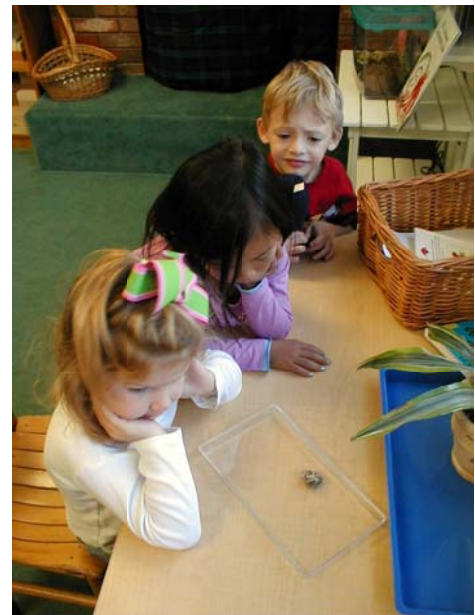
A visit with Hermione the Hermit Crab

Toward the middle of October, we will introduce Native American themes. If you have a special interest in this topic, or know someone who does, please feel free to share with us. I am also eager to find a family to host this year's Pow- Wow in early November. Thank you for helping us to have such a wonderful month.