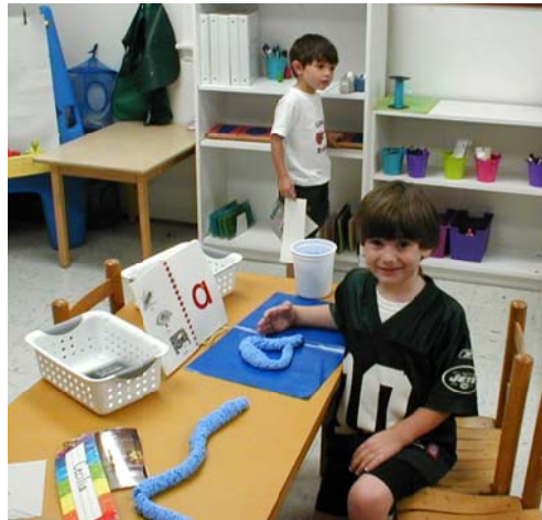
PK friend makes foam letters

I am often reminded as I watch preschoolers, that children develop and experiment with so many vital life skills at this age. These foundational experiences influence how they approach the world for years to come. Preschool is a testing ground for social skills because it offers an environment rich in different personality types, levels of development and communication styles. To learn how to handle the full range of social possibilities, one must be exposed to them! Our classroom is abuzz with chatter, conflict and resolution, shared experiences and the joy of discovery. It has been such a truly happy month in Pre-K. We have a very compatible group of friends and they have transitioned so easily from home to school. The rhythms of the