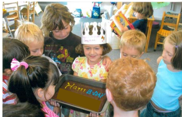
Birthdays are more fun when shared with friends.