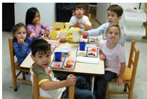
Fun at the snack table

I am often reminded as I watch preschoolers, that children develop and experiment with so many vital life skills at this age. These foundational experiences influence how they approach the world for years to come. Preschool is a testing ground for social skills because it offers an environment rich in different personality types, levels of development and communication styles. To learn how to handle the full range of social possibilities, one must be exposed to them! Our classroom is abuzz with chatter, conflict and resolution, shared experiences and the joy of discovery. It has been such a truly happy month in Pre-K. We have a very compatible group of friends and they have transitioned so easily from home to school. The rhythms of the