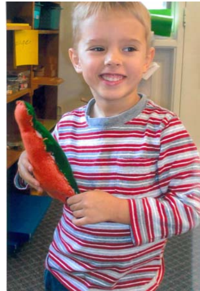
Wow! Our friend feels (and looks) proud of his handmade dinosaur.

We want to thank the Elementary class for helping us learn about peace, letting us add decorations to their flag, and including us in the Peace One Day celebration on Friday. As one of our classmates said "We have peace right here at the Tidewater School." We feel so fortunate.