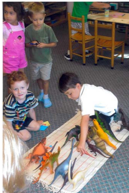
Kindergarten friends sorted the dinosaurs - those standing on four legs and those on two legs.

We continued being detectives. This time we were dinosaur detectives called paleontologists. We looked for dinosaur evidence by digging in our sand box. We couldn't believe how much digging we had to do day after day before we found our first bone. Luckily, our elementary and after school friends helped us dig for bones, too. It's like a puzzle trying to put the bones together.