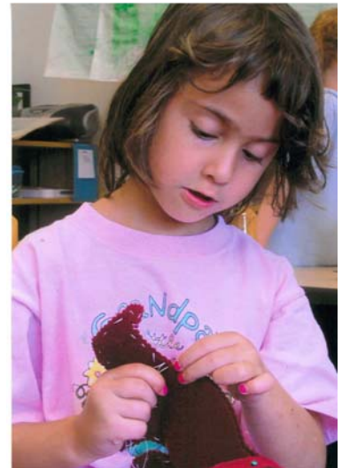
Concentrating on sewing a felt dinosaur.

One morning we found evidence that lead us to believe that we'd had a visitor: a tennis ball, tags, a collar, a leash and a bumpy, red ball. Even without seeing anything, we put these clues together and wondered if a dog might have visited our room. We thought it was a small dog because the collar was not very big and the toy was just the right size for a small mouth. We were being detectives.