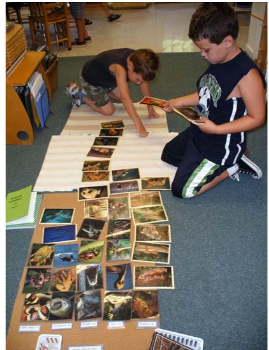
Elementary friends categorize zoology cards.

We made a peace banner to celebrate Peace One Day with Pre-K and Kindergarten. First, we designed it. Then we cut pieces of fabric and the elementary sewed them onto the banner. When we finished sewing, we helped the Pre-K and Kindergarten paint. It was really fun! The Pre-K did butterflies with their hands and the Kindergarten did flowers with their fingers. The next day was Peace One Day. We played, laughed and had a lot of fun.