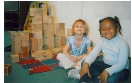
PK friends have laid out the base ten number system

There are so many things that a child learns in the course of a year in Pre-K, but the most amazing thing of all is that they each do it according to their own unique developmental schedule. We prepare the setting and the young child does the work. When I think of all the pre-schools that I visited as a young parent, I feel so fortunate to have found a place in which my children could define themselves at their own pace.