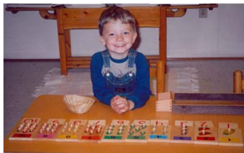
Working on a counting task

It is hard to believe that we are at the end of the year in Pre-K. There has been so much growth in our classroom that it is nothing short of miraculous. As I fill out the curriculum checklists for our students I marvel at the progress that has occurred in each area. Some children have found their voices while others have learned to be less intense in their interactions. Other friends have learned to negotiate their way out of a conflict while some have discovered that they have the right to complain about something! Numbers now represent quantities to some while others have begun to see the vertical and horizontal patterns in the hundred board work.