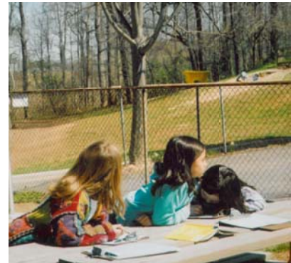
LE friends working outside

The Lower Elementary will be going to two plays this May: If You Give a Mouse a Cookie and Junie B. Jones .