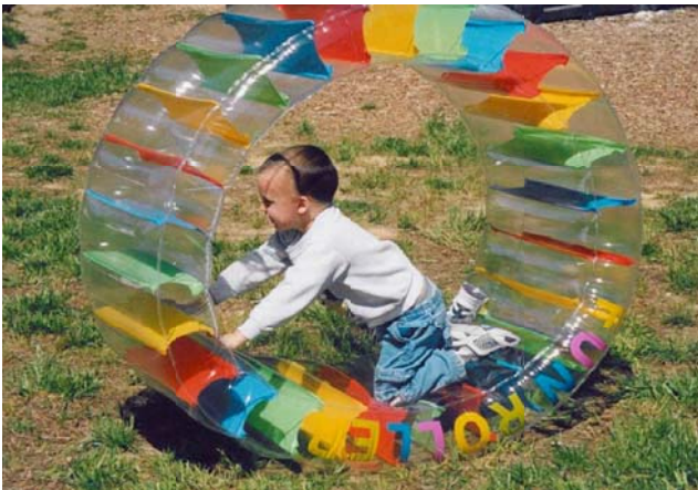
PK friend plays on the exercise wheel

The playground is a wonderful place in which to reflect on a child's growth. One child who would not go near any of the equipment at the beginning of the year cannot run fast enough to the swings. Another friend who would not go near the sand earlier actually dares to get dirty! The children have learned to trust themselves in all sorts of ways. And they joyfully run and scream and jump and dig all while exercising their skills of negotiation, problem-solving, volley of conversation, and a host of others. It has been a magical year.