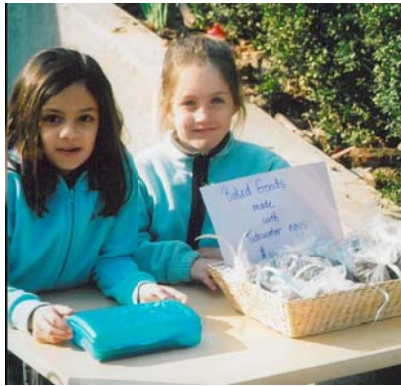
LE friends selling baked goods for The Humane Society