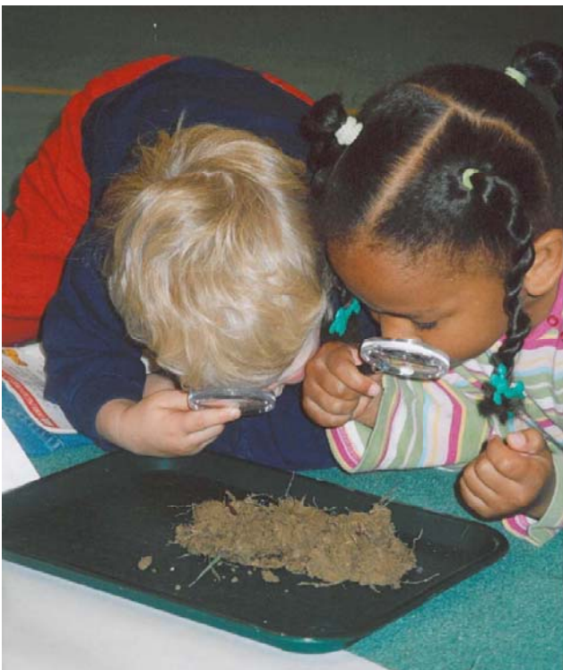
Looking at worms

The playground is a wonderful place in which to reflect on a child's growth. One child who would not go near any of the equipment at the beginning of the year cannot run fast enough to the swings. Another friend who would not go near the sand earlier actually dares to get dirty! The children have learned to trust themselves in all sorts of ways. And they joyfully run and scream and jump and dig all while exercising their skills of negotiation, problem-solving, volley of conversation, and a host of others. It has been a magical year.